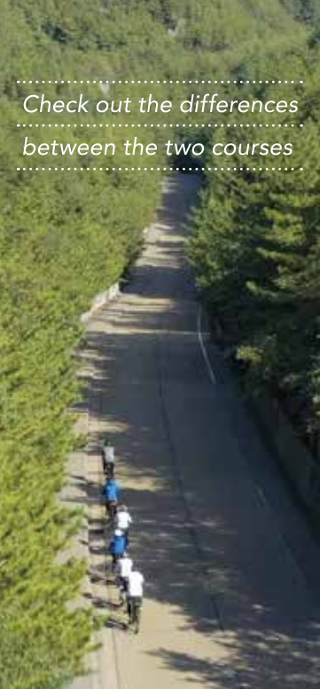
Heading to Yunohira Observatory