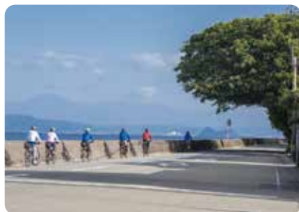
Fujino Ako Community