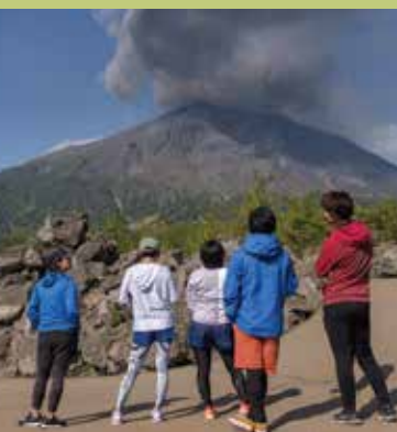
Arimura Lava Observatory

At the end of the slope that you keep climbing — a spectacular view!